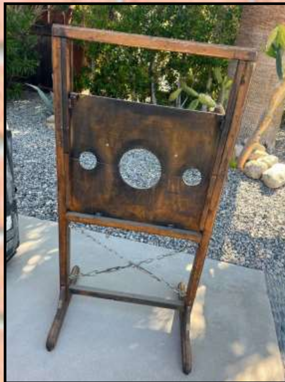
Changing places - trick $800