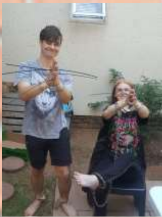
Covered in zip-ties? No problem for this family!