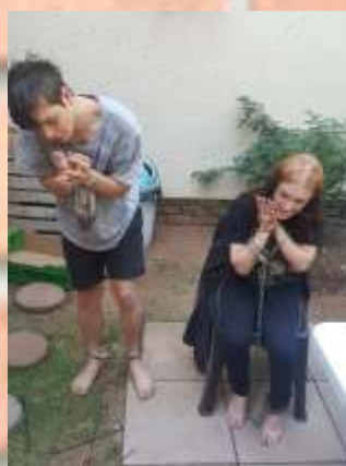
It is Brother vs. Sister... Who will escape first?

1) How old were you when you learned that you wanted to follow in your father's footsteps?